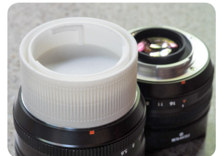
A double lens cap allows Krebs to change lenses with one hand without dropping his valuable equipment.