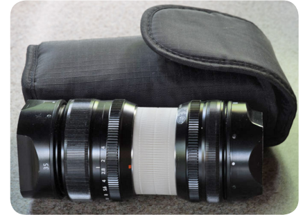
Doubled-ended lens cap with two lenses for the smaller mirrorless Fujifilm X Compact Systems Camera.

“Actually having the product and using it, and using your customer service...I’ve been most impressed with the company as a whole and the software.”